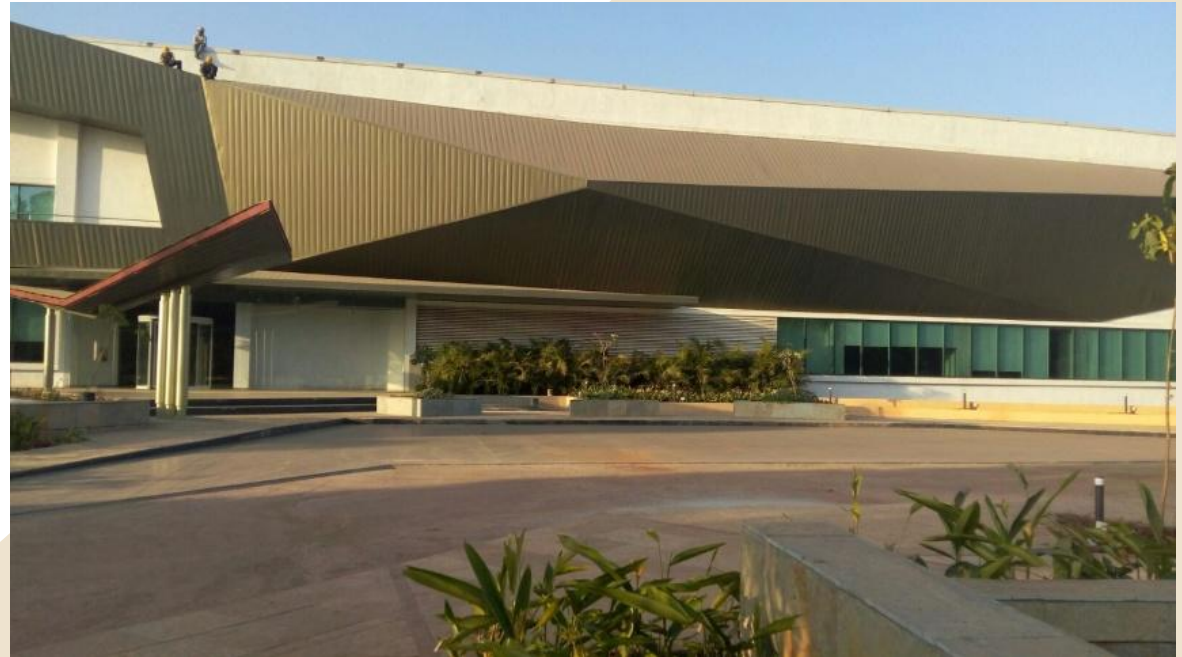
BAJAJ AUTO R&D OFFICE, PUNE