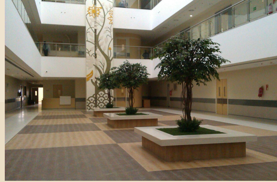
AMRI HOSPITAL LOBBY, BHUVNESHWAR